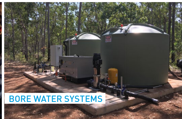
BORE WATER SYSTEMS