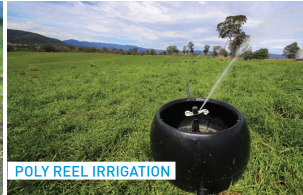
POLY REEL IRRIGATION