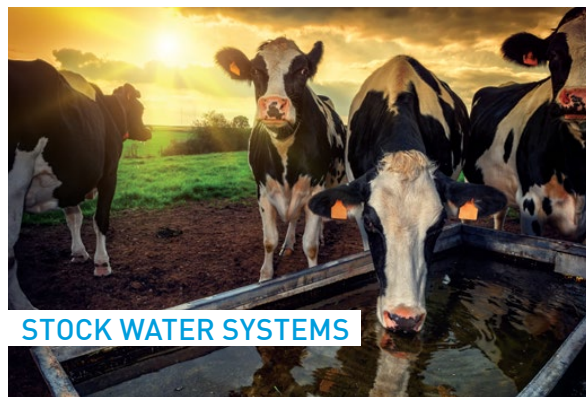
STOCK WATER SYSTEMS