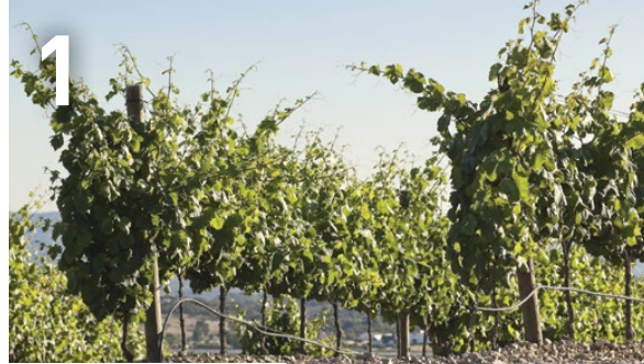
1 DRIP IRRIGATION