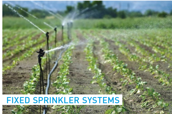
FIXED SPRINKLER SYSTEMS