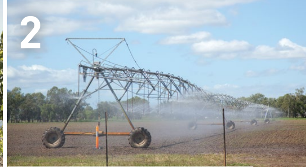
2 CENTRE PIVOTS & LATERAL MOVE