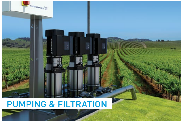
PUMPING & FILTRATION